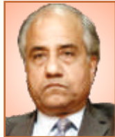
Mr. Justice B. N. Srikrishna Former Judge, Supreme Court of India