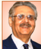
Mr. Y. C. Deveshwar Chairman, ITC Ltd.