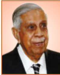
Hon'ble Mr. Justice M. N. Venkatachaliah Former Chief Justice of India Chairman of Jury